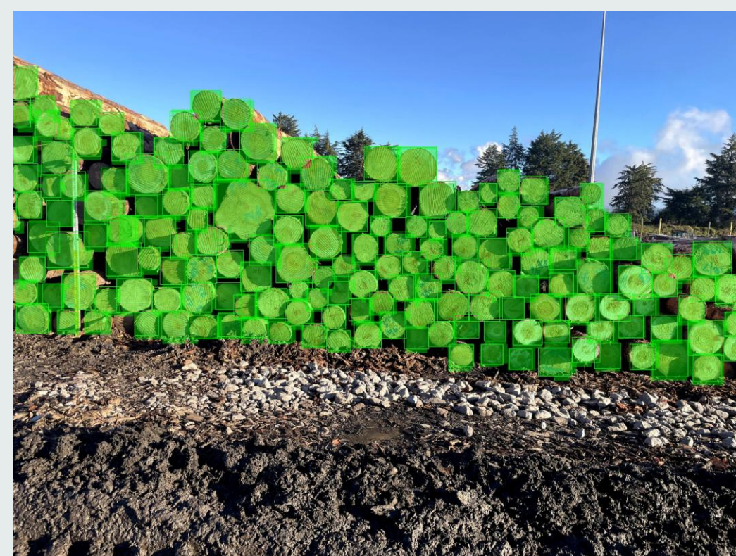
Figure 4: Log detection [Bounding boxes]