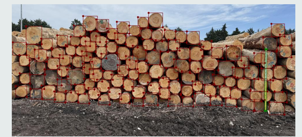
Figure 3: Full bounding box annotations including ruler