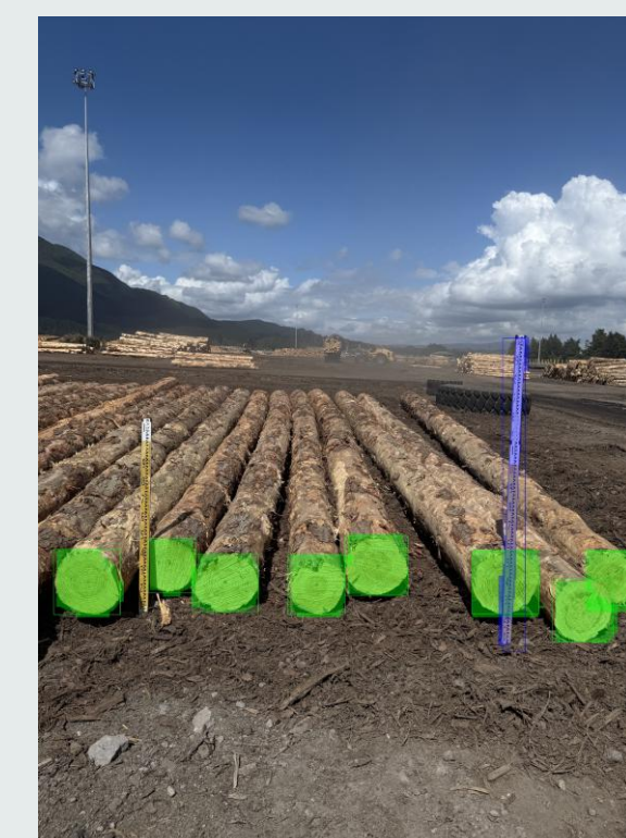
Figure 7: Volume estimation on test set