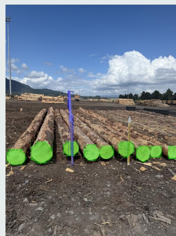
Figure 6: Sample of test set post detection