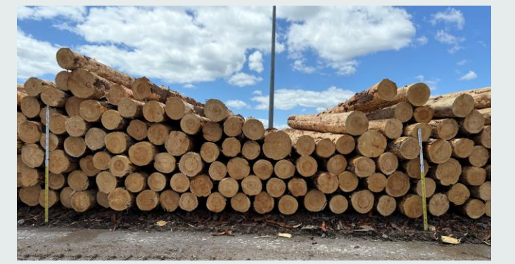
Figure 1: Sample of dataset images