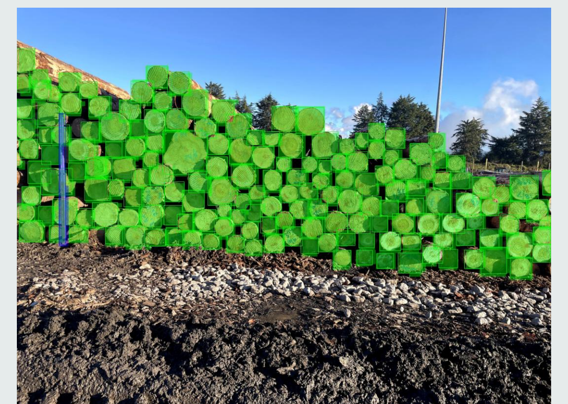
Figure 5: Detection pipeline [Log + Ruler]